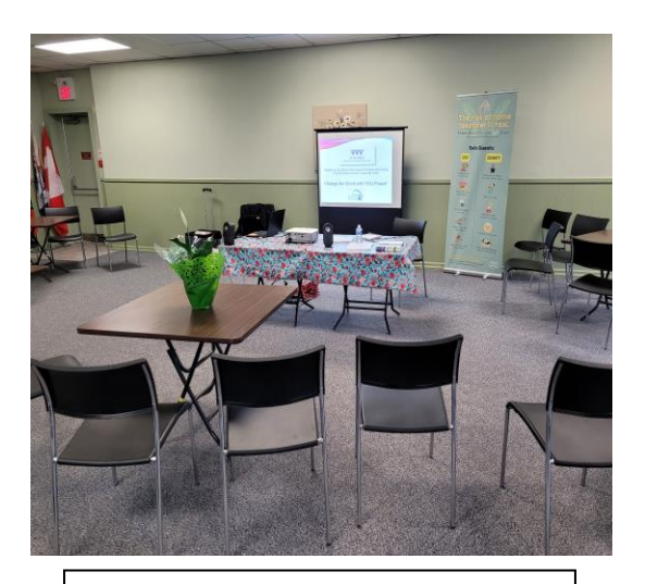
It's Not Right Session in Mildmay, March 27, 2024

Home Takeover is a form of elder abuse and can increase the vulnerability of older adults to other types of abuse. A local project is underway that addresses the risks of elder abuse. The project is led by the Grey Bruce Elder Abuse Prevention Network (GBEAPN) and aims to increase awareness and build community capacity to reduce the incidence of elder abuse. Older adults have been attending educational sessions throughout Grey-Bruce to learn about the risks, identification, and response to elder abuse. As part of the educational program, called "It's Not Right", participants learn about the issue and impacts of home takeover. Older adults can be targeted and are especially vulnerable to victimization through financial exploitation. The Grey Bruce Community Legal Clinic provides public education upon request about legal issues relevant to protecting older adults from abuse, such as tenant rights and powers of attorney. For more information about the Elder Abuse Prevention Project or GBEAPN, contact Angela Yenssen at angela.yenssen@gbclc.clcj.ca